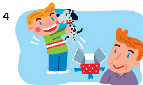
It / a dog