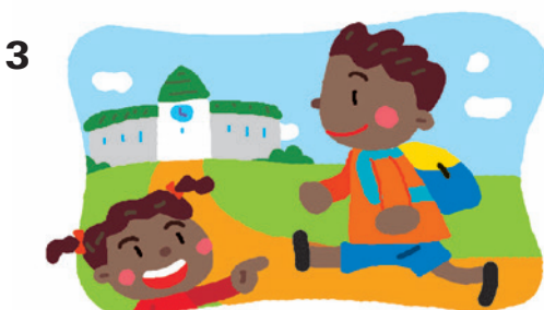
You / a student